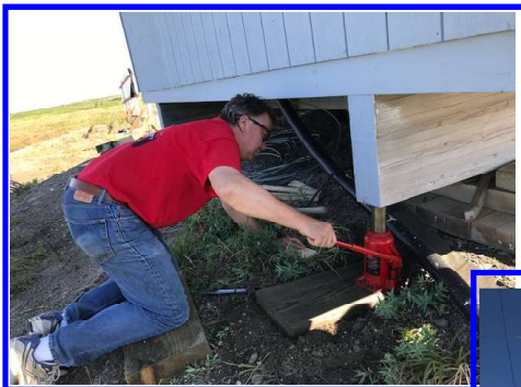
Leveling the Phasor Building at the Tower site

We are blessed to have so many teams willing to make the long trek to Nome to help get those needed summer maintenance projects done. This year, we anticipate four groups total, with three coming this month. Below, and on the following page, is a bit of a photo journal of the work completed so far. We are grateful to our June team, Coast to Coast, a group of family and friends from across the country (PA, VA, IL, and CA represented) for getting so much of the construction work done. The weather was glorious, and they worked hard, but played hard as well, enjoying all that Nome had to offer. A group from Vista Covenant in Minnesota will be here in early August to get more of the painting done, and groups from Community Covenant Church in Eagle River, AK, and Grace Community Covenant Church in Tucson, AZ, will round out our summer. These folks give sacrificially of their time and talent to further the ministry of KICY, and we are grateful.