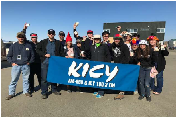
Coast to Coast, marching in the Midnight Sun Parade

We are blessed to have so many teams willing to make the long trek to Nome to help get those needed summer maintenance projects done. This year, we anticipate four groups total, with three coming this month. Below, and on the following page, is a bit of a photo journal of the work completed so far. We are grateful to our June team, Coast to Coast, a group of family and friends from across the country (PA, VA, IL, and CA represented) for getting so much of the construction work done. The weather was glorious, and they worked hard, but played hard as well, enjoying all that Nome had to offer. A group from Vista Covenant in Minnesota will be here in early August to get more of the painting done, and groups from Community Covenant Church in Eagle River, AK, and Grace Community Covenant Church in Tucson, AZ, will round out our summer. These folks give sacrificially of their time and talent to further the ministry of KICY, and we are grateful.